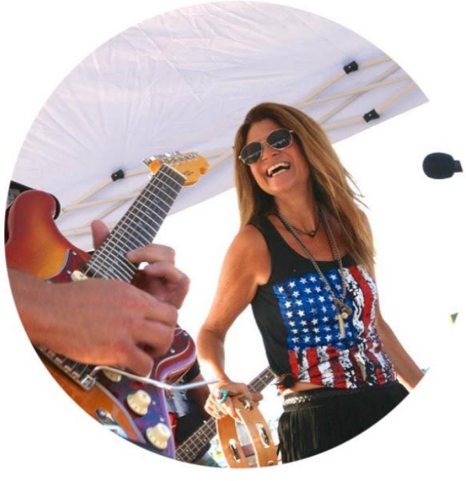
The Lynn Blue Band