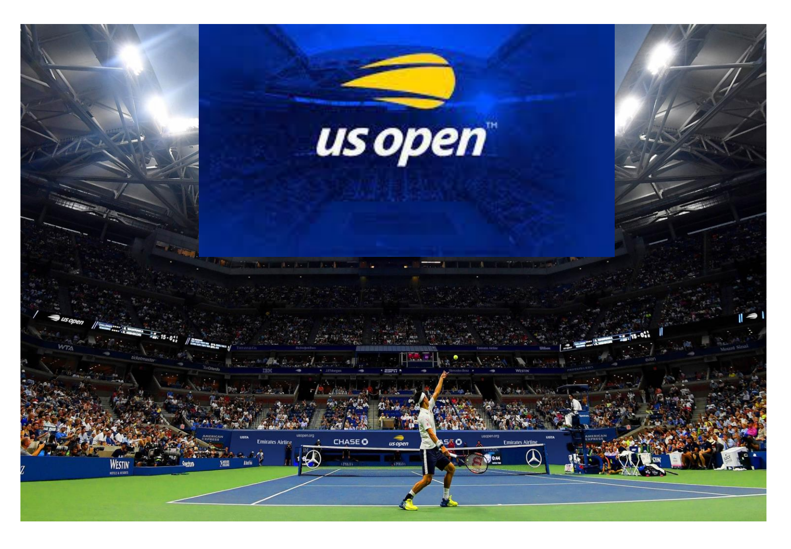
U.S. OPEN COURTSIDE SEATS