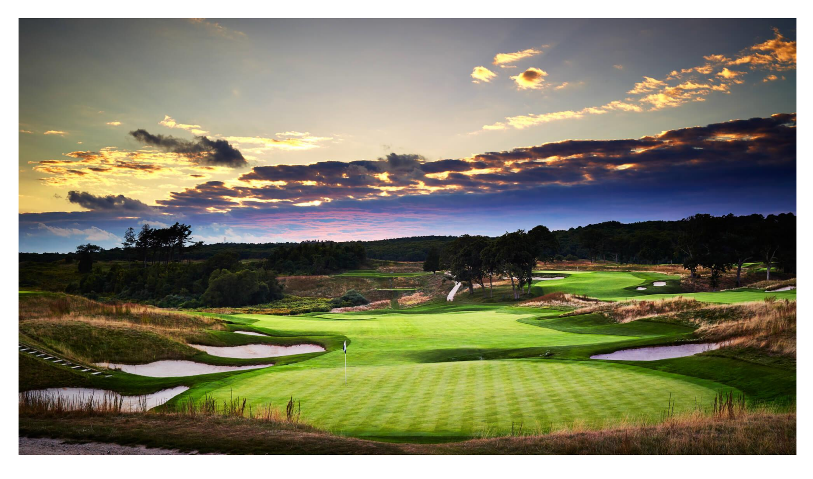
EIGHTEEN HOLES AT THE ATLANTIC GOLF CLUB for you and three friends